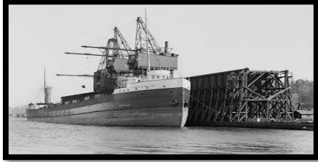
Shipping - Houghton