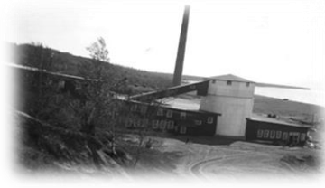
Copper Mill- Freda