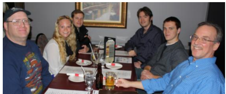
GLMA cadets and Lodge #2 members.

overview of operations. The tour was followed by lunch at the Open Grill Restaurant, Point Edward, ON, and a short tour of the Lakes Pilots Association office and boats in Port Huron. 53 members and guests participated, representing Port Huron Lodge #2, Detroit Lodge #7, Niagara Lodge #20, and Buffalo Lodge #1. Four cadets from Great Lakes Maritime Academy also traveled from school to participate in the tours.