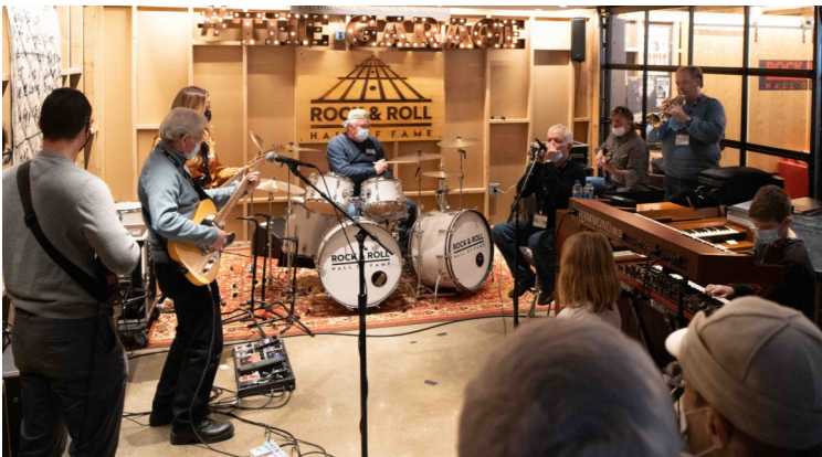
“Garage” at Rock Hall.

Convention attendees were able to participate in a visit to Cleveland’s Davis Aerospace and Maritime High School; Samsel Supply Co.; Collision Bend Brewery; and the Rock & Roll Hall of Fame. If you missed the R&R Hall of Fame trip, you missed some talented ISMA musicians who entertained us with a jam session in the “Garage” area of the museum!