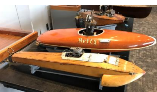
Examples of tethered powered model racing hoats

where model boats were raced on a 52-foot tether cable, one at a time. These boats, with gas and steam engines, were all