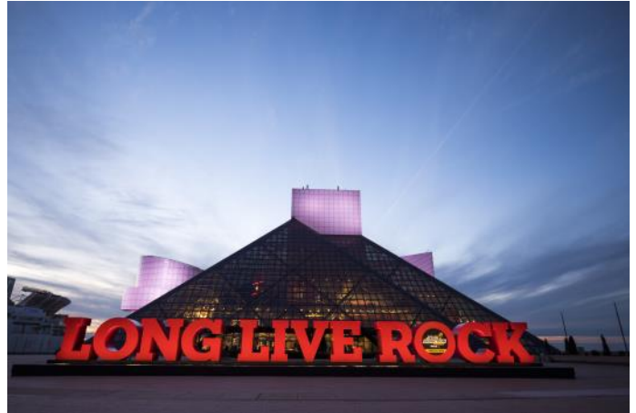
Above: Rock Hall exterior. Below: "Garage" at the Rock Hall.

Saturday's theme night is "Come as a Rock Star or a Band Groupie."